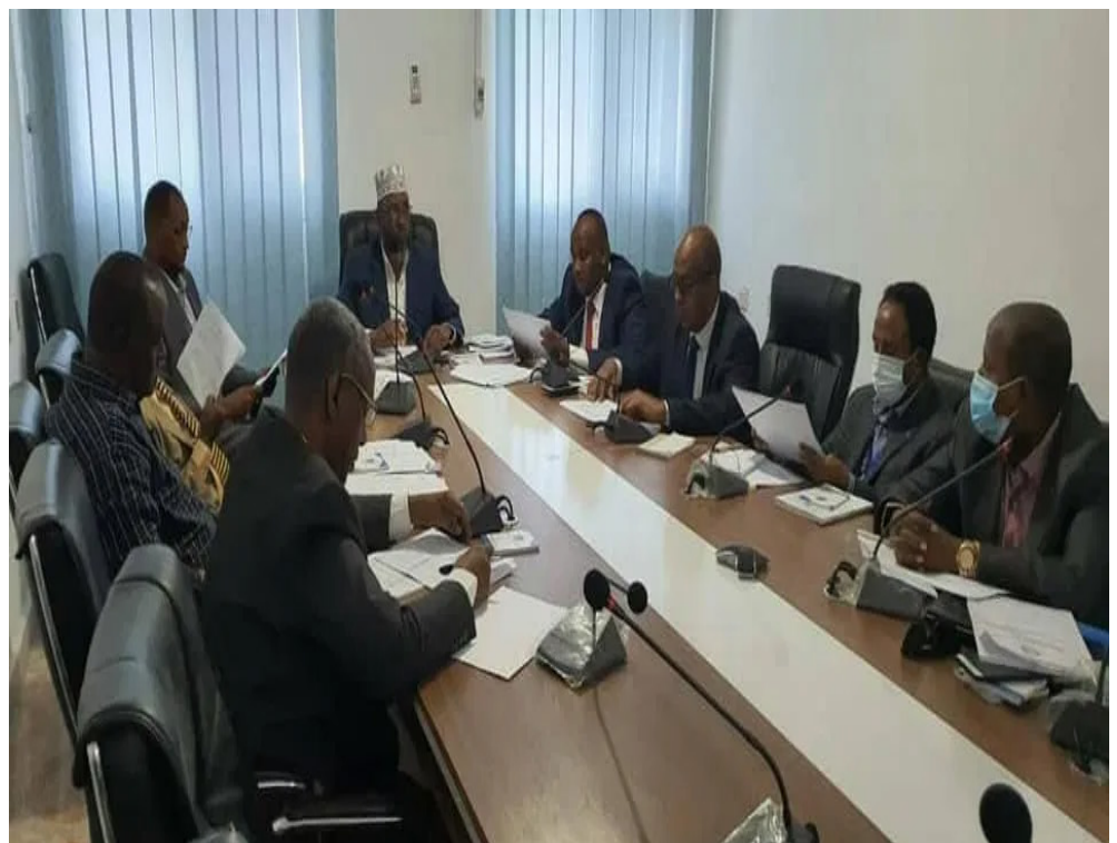
NIEC met with the Parliamentary security and Regional Governments Committee

The meeting was to meant to deliberate on the amendments to the Political Parties Law, currently under review by Parliament.