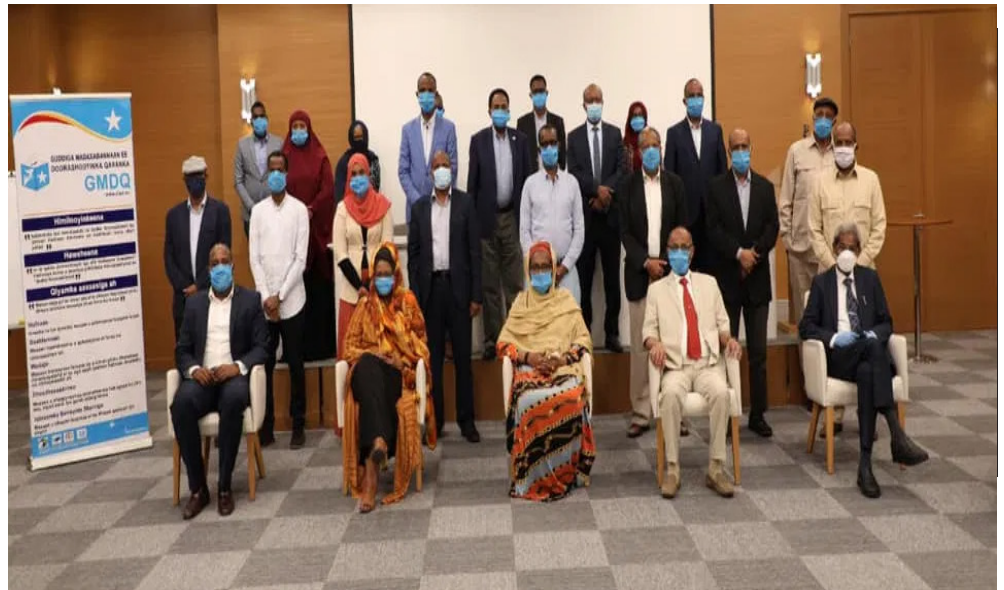
NIEC Commissioners and staff members