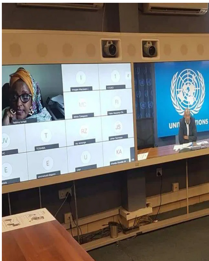
NIEC and representatives of the International Community