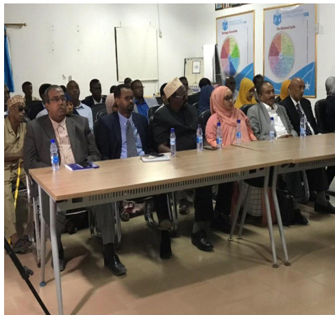
NIEC awards temporary certificates to political parties