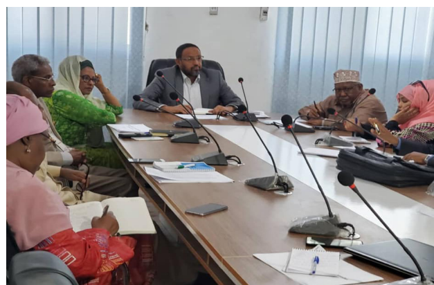
NIEC meeting with parliament interim committee for the national electoral law

On 17th Feb 2020, the electoral commission met in Mogadishu with the Interim Committee of the parliament responsible for the preparation of the National Electoral Law. After exchanging ideas on the preparation for the recent National Electoral Law passed by the two Houses of the Federal Republic of Somalia, NIEC has shared with the Interim Committee their recommendations on the latest version of the electoral law recently adopted by the houses. NIEC is committed to be prepared for the upcoming election in 2020 at the level of their mandate and role.