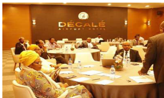
NIEC met with joint parliamentary committee

The Parliamentary committee was selected from both houses of Parliament to draft regulations for the finalization of the electoral law, which the President of the Federal Republic of Somalia accented into law last month.