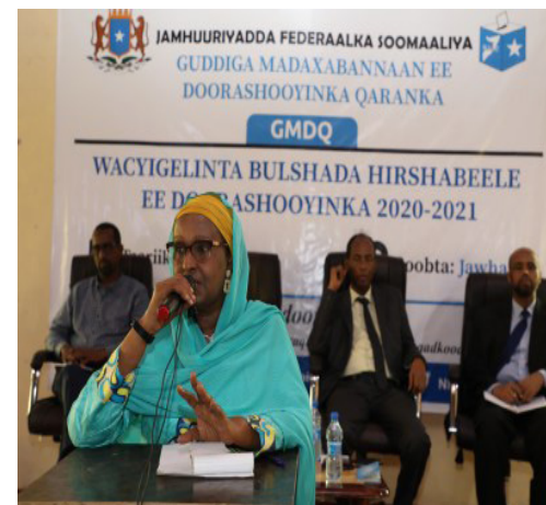
NIEC consult with the members of the Hirshabele state community

On 25 February 2020, the National Independent Electoral Commission held an extensive meeting in Jowhar city, attended by various members of the community including; Women, Youth, Disabled, intellectuals, University Students and Local Elders to consult and listen to their concerns about the upcoming election. The meeting was aimed at creating public awareness of the 2020-2021 election and was focused on