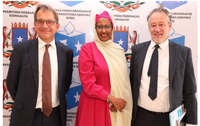
NIEC chair with Sweden's ambassador