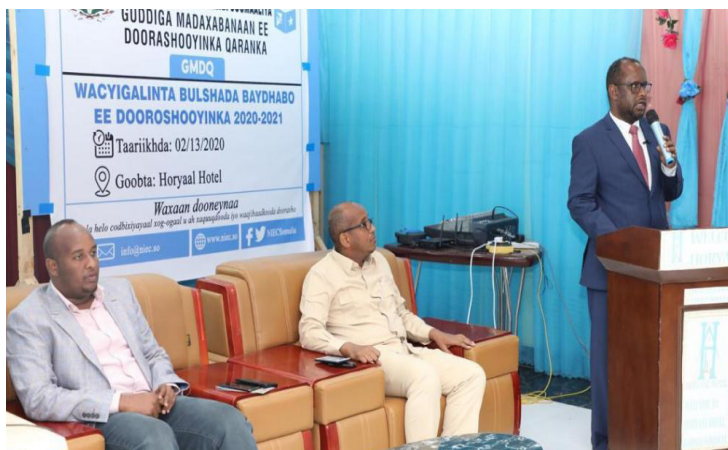
NIEC with various parts of the Baidoa community

13Feb, 2020, the National Independent Electoral Commission met in Baidaba today with various parts of the community. The meeting was aimed at creating public awareness of the 2020-2021 election, and was focused on providing the