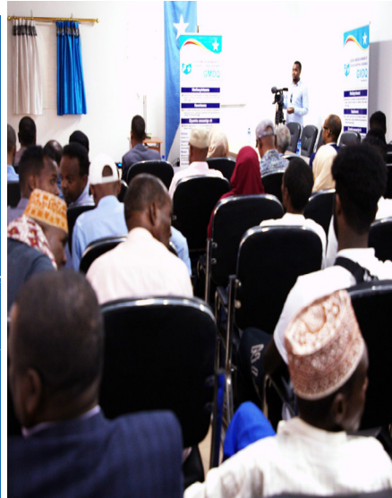
NIEC awards temporary certificates to newly registered political parties